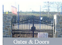
Gates & Doors