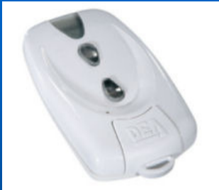
TD2 Cloning Remote