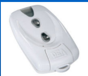
TD2 Cloning Remote